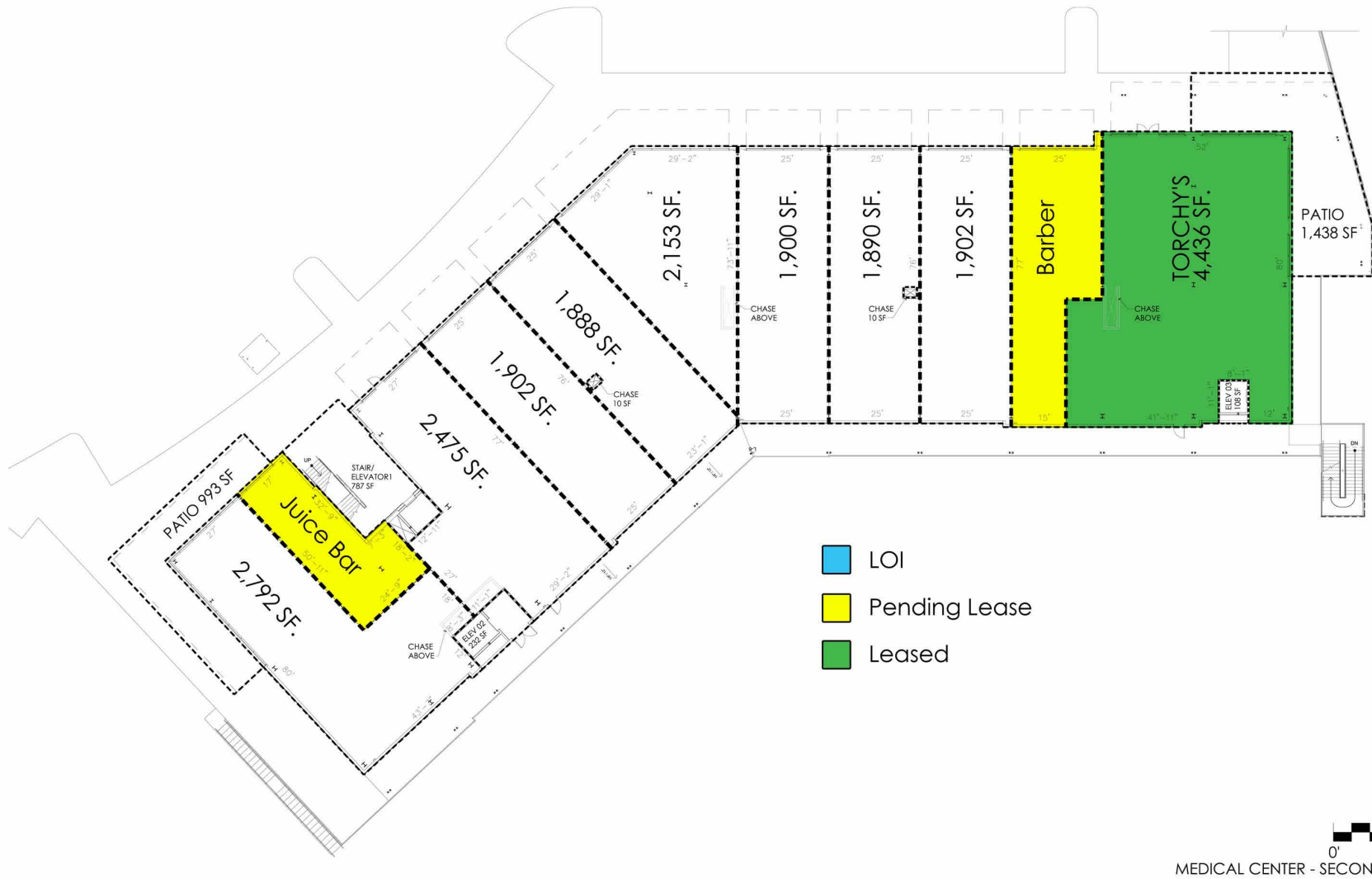
MEDICAL CENTER - SECOND FLOOR - LP1 021820