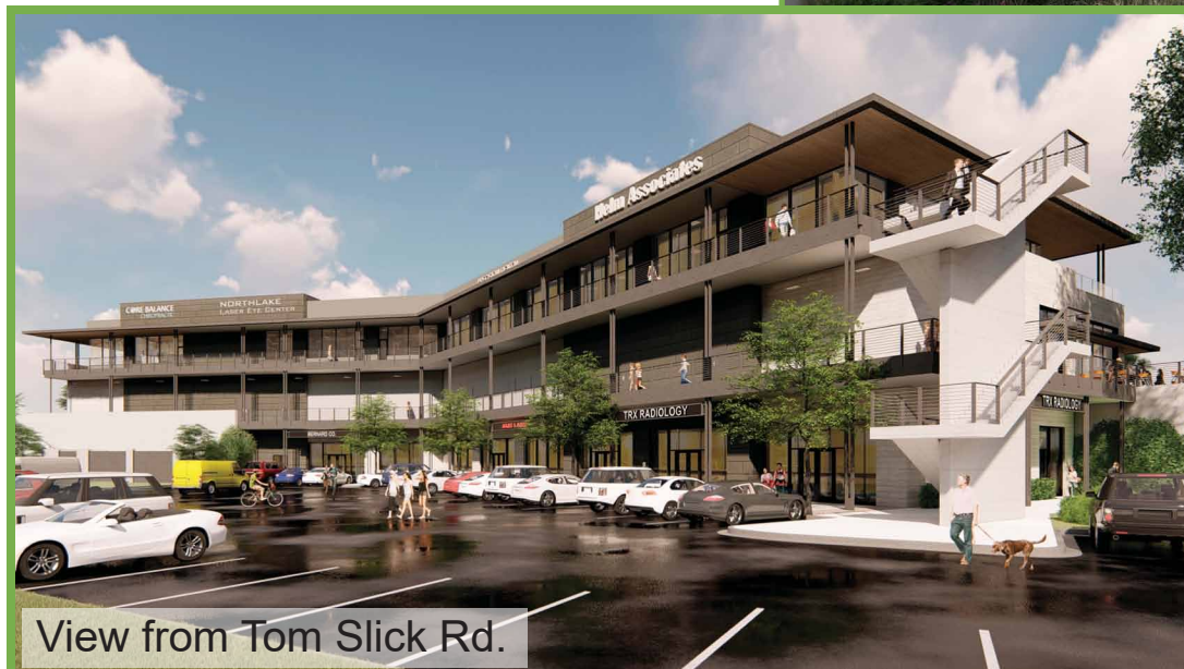
View from Tom Slick Rd.

8435 Wurzbach is located at the gateway to the South Texas Medical Center.