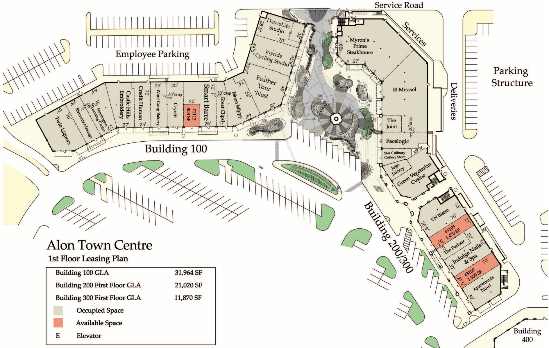
Alon Town Centre 1st Floor Leasing Plan