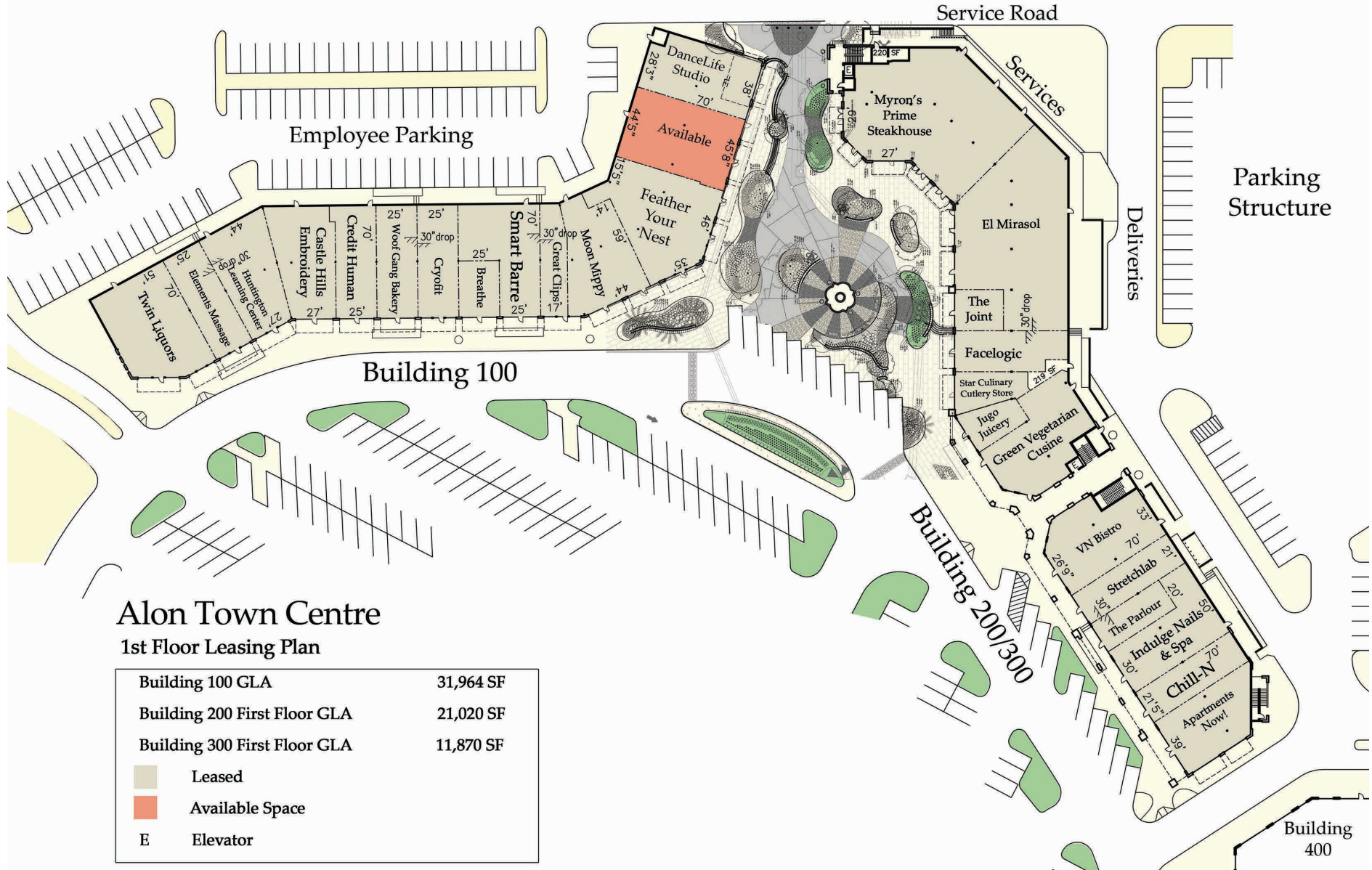
Alon Town Centre 1st Floor Leasing Plan